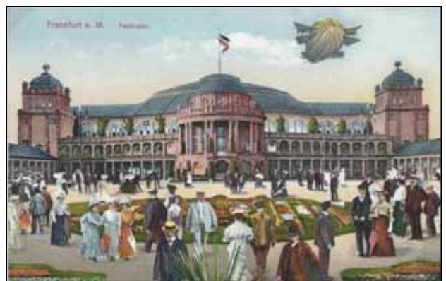
Zeppelin II over Festhall (main exhibition hall) entrance.

Hank showed many postcards and souvenirs from the show, including items postmarked from the show's own post office.